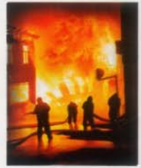
HFFR Cables will avert such devastating fires.

The devastating effect of fire is so great that for high risk areas and public places, such as, chemical and power plants, theatre, hospital, commercial complex, metro railway, high rise office and residential building, etc, only HFFR wire should be used to avert loss of life and damage to assets.