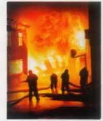
HFFR Cables will avert such devastating fires.

The devastating effect of fire is so great that for high risk areas and public places, such as, chemical and power plants, theatre, hospital, commercial complex, metro railway, high rise office and residential building, etc, only HFFR wire should be used to avert loss of life and damage to assets.